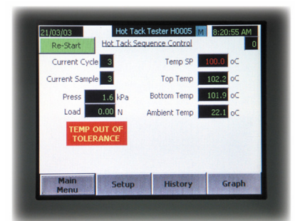
Touch Screen Operation